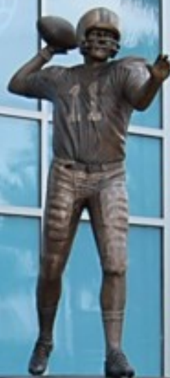
STEVE SPURRIER Quarterback 1962 - 1966 Heisman Trophy Winner 1964