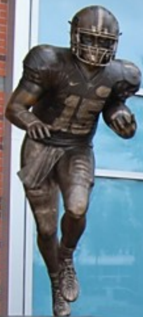
TIM TEBOW Quarterback 2006 - 2009 Heisman Trophy Winner 2007