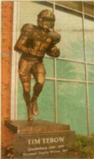
The Heisman Trophy statue and granite memorial of Tim Tebow stands outside of Ben Hill Griffin Stadium at the University of Florida in Gainesville.