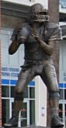
DANNY WUERFEL Quarterback 1991 - 1994 Heisman Trophy Winner 1994